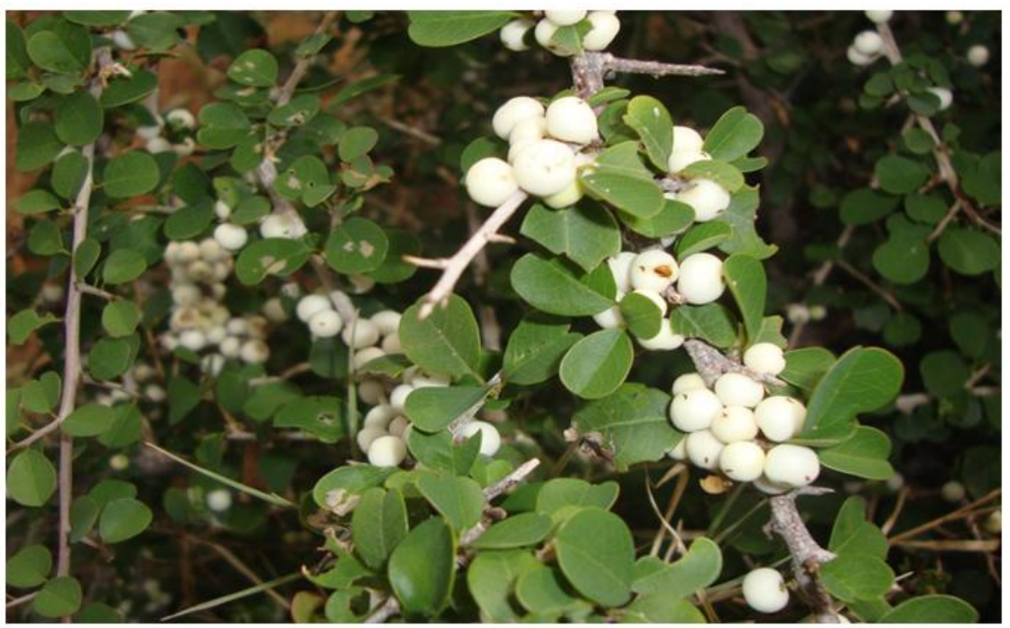
Figure 1. Habit and fruits of Flueggea leucopyrus Willd.

The dried fruit materials were pulverized into fine powder using a grinder (mixer). About 40gm of powdered fruit was extracted successively with 200 ml of hexane (62-66°C), chloroform (60-62°C) and methanol (56-60°C) in Soxhlet extractor until the extract was clear. The solvent extracts were evaporated by using rotary vacuum evaporator (Model: PBV – 7D) and the resulting pasty form extracts were stored in refrigerator at 4°C for further use <sup>[16]</sup>.